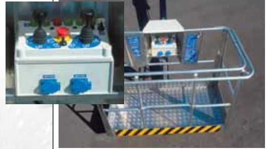
The basket of the DINO 260XT is spacious. Stepless control of boom movements is possible with two joysticks.